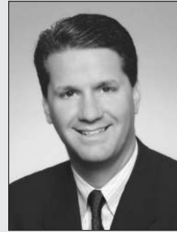
John Calipari Head Coach