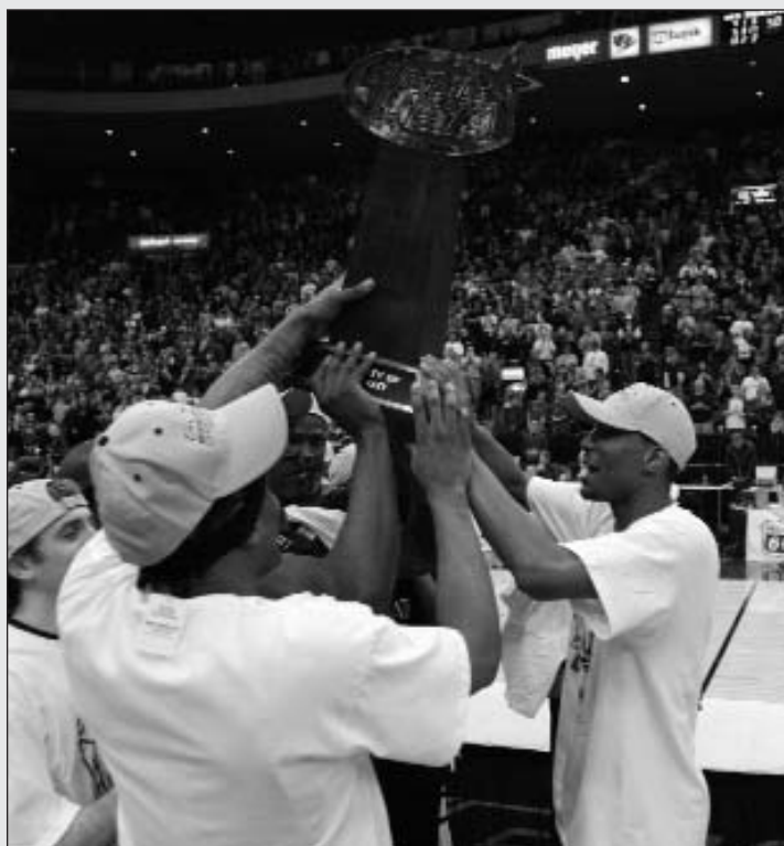
Cincinnati celebrates its fourth C-USA tournament victory after defeating DePaul, 55-50, at U.S. Bank Arena in Cincinnati.